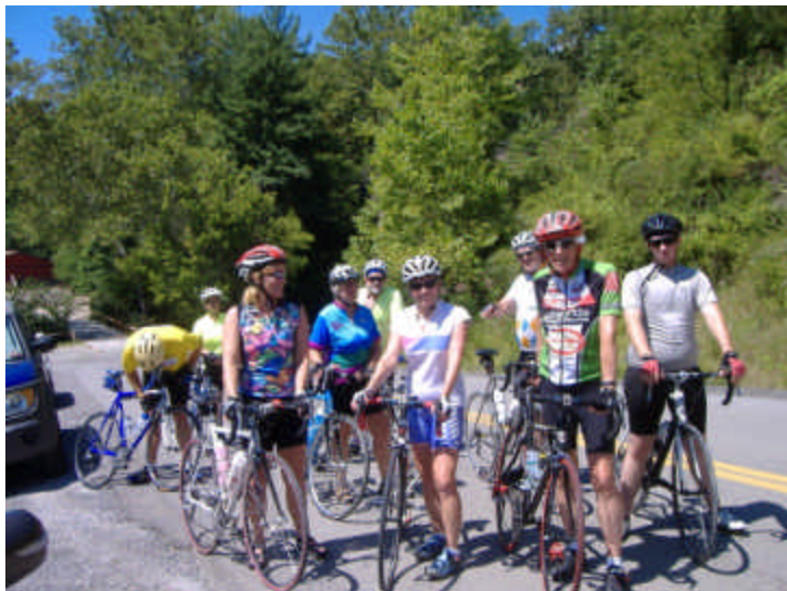
No racing here, our Jarvisville Loop ride Aug. 24

The WVMBA has added a downhill race to its schedule September 28 at Timberline (Canaan). Start time is 12pm Sunday with a mandatory riders meeting at 11:30 at the top of the lift. Registration is on Saturday 9 -12 and Sunday 8-10:30 am at the Timberline bike shop. There is a Saturday timed practice from 1 to 3, riders must be registered for Sunday's event to participate. A Saturday and Sunday all day lift pass is included with registration on Saturday for Sunday's event. Entry fee is $45 Info:800-766-9464 ext.129 or jrnolan@comcast.net