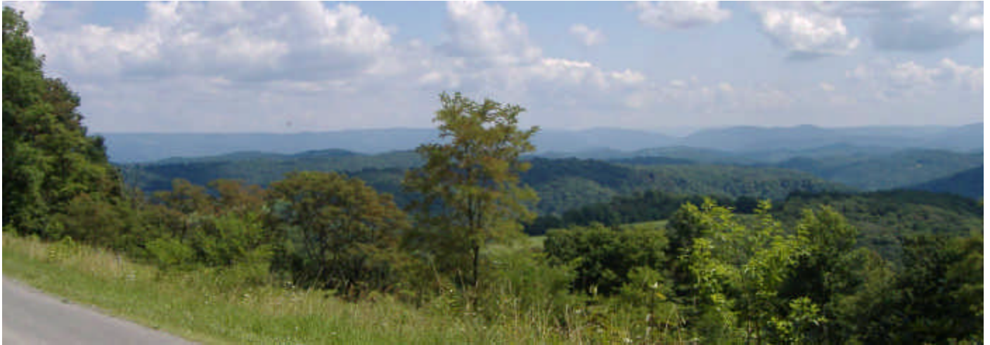
TEXAS MOUNTAIN ROAD VISTA EASTWARD